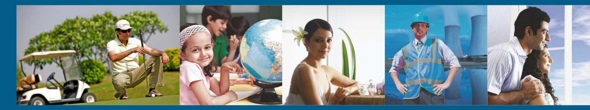
Chart on a course that sets your pulse racing.

Orris is driven by passion, commitment, quality and a relentless pursuit of perfection. In its endeavor to offer quality life, Orris has diversified into Real Estate, Energy, Hospitality, Golf, and Education. With Corporate Social Responsibility embedded in the DNA, Orris is guided by a strong vision and the competency to achieve excellence beyond the expectations of its customers. This, Orris believes, will build the India of the future.